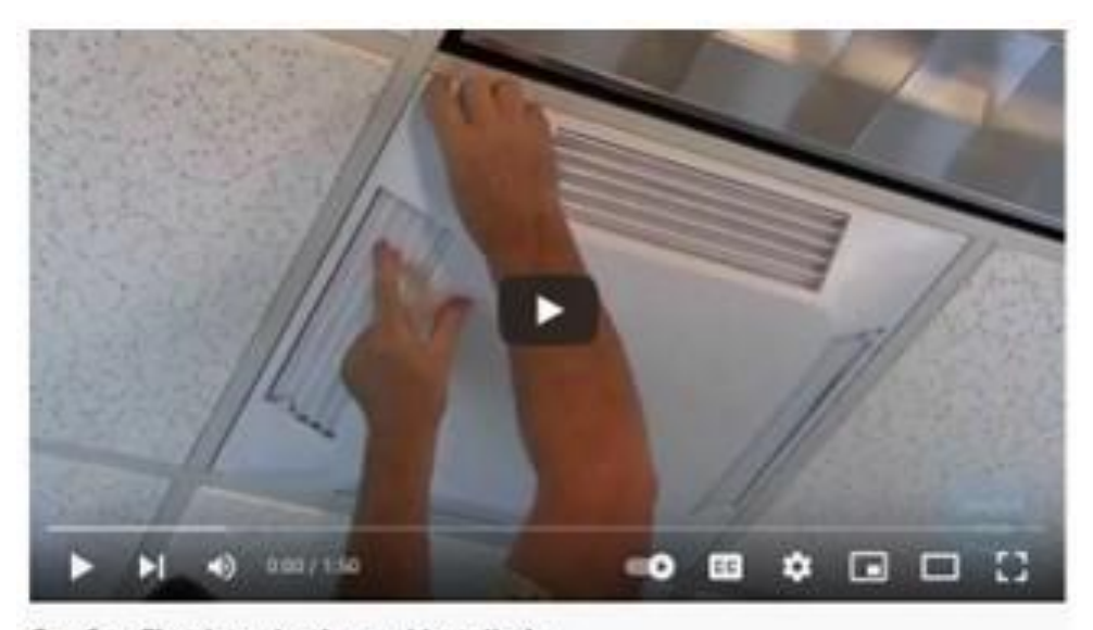
Comfort First Introduction and Installation